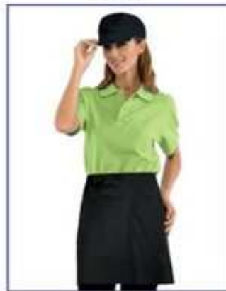
086200 65% polyester 35% cotton NERO