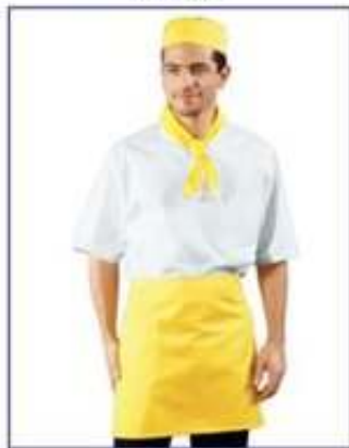
086014 65% polyester 35% cotton GIALLO