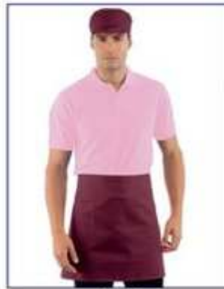
086003 65% polyester 35% cotton BORDEAUX