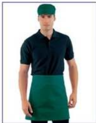
086004 65% polyester 35% cotton VERDONE