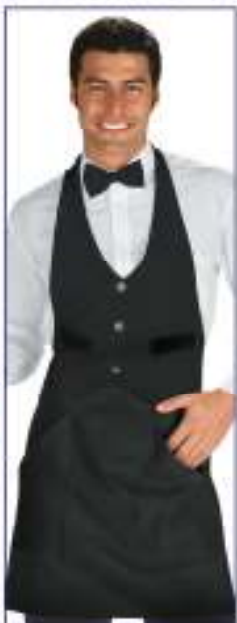
037001 NERO + NERO