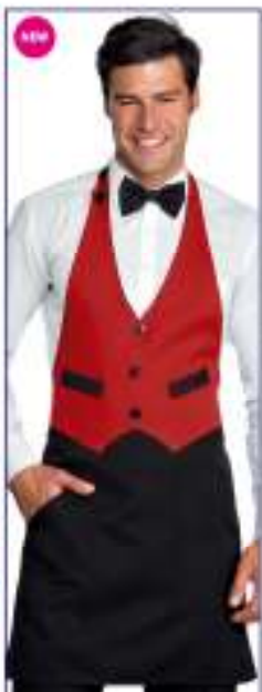
037007 ROSSO + NERO