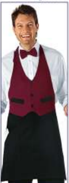
037003 BORDEAUX + NERO