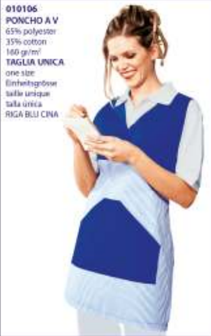
010106 PONCHO A V 65% polyester 35% cotton 160 gr/m 2 TAGLIA UNICA one size Einheitsgröße taille unique talla única RIGA BLU CINA