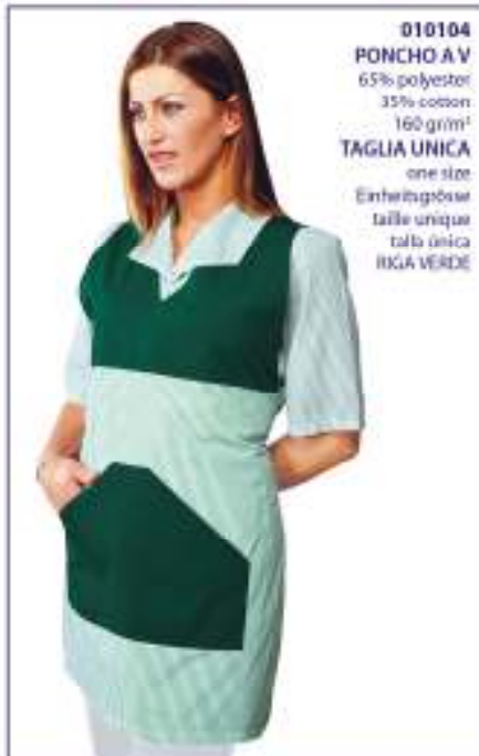
010104 PONCHO A V 65% polyester 35% cotton 160 gr/m 2 TAGLIA UNICA one size Einheitsgröße taille unique talla única RIGA VERDE