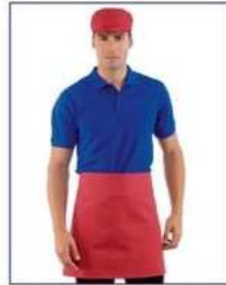
086007 65% polyester 35% cotton ROSSO