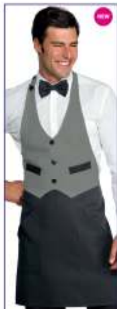
037087 GRIGIO + ANTRACITE