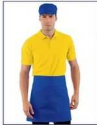
086006 65% polyester 35% cotton BLU CINA