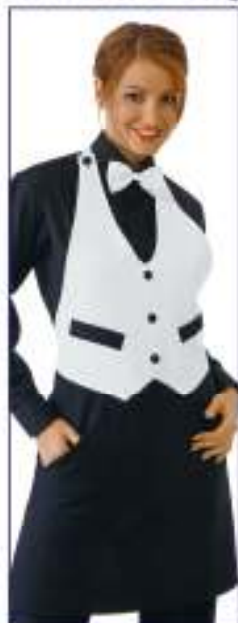
037000 BIANCO + NERO