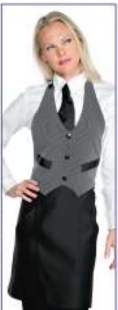
037008 GESSATO + NERO