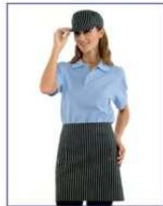
086400 65% polyester 35% cotton LONDRA