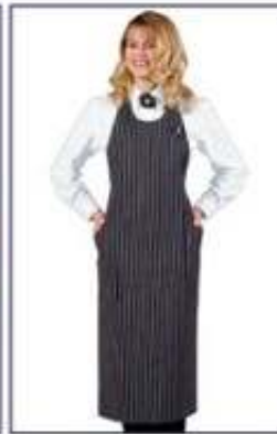
049100 LONDRA polyester 65% cotton 35%