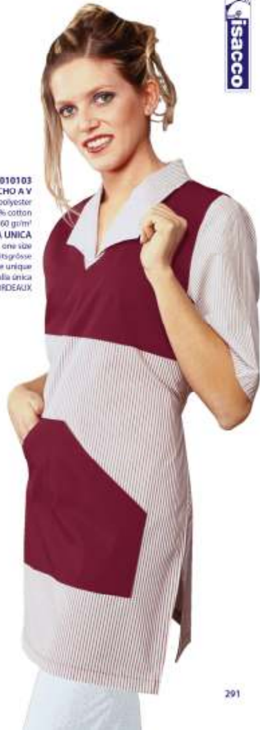
010103 PONCHO A V 65% polyester 35% cotton 160 gr/m 2 TAGLIA UNICA one size Einheitsgröße taille unique talla única RIGA BORDEAUX