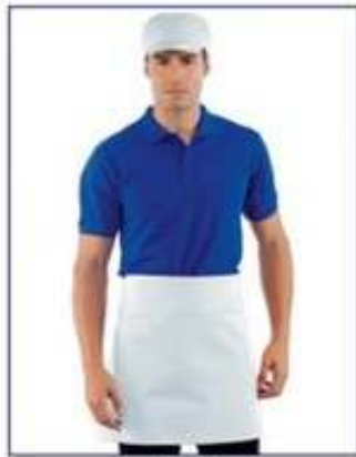
086001 100% cotton BIANCO